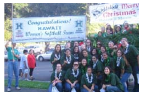
And clement weather blessed the Annual Mānoa Christmas parade, where we were joined by the winning UH girls' softball team.