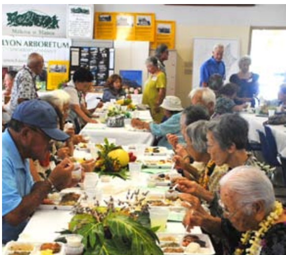
An ono Hawaiian luncheon was served to 60 kūpuna, their families and guests.