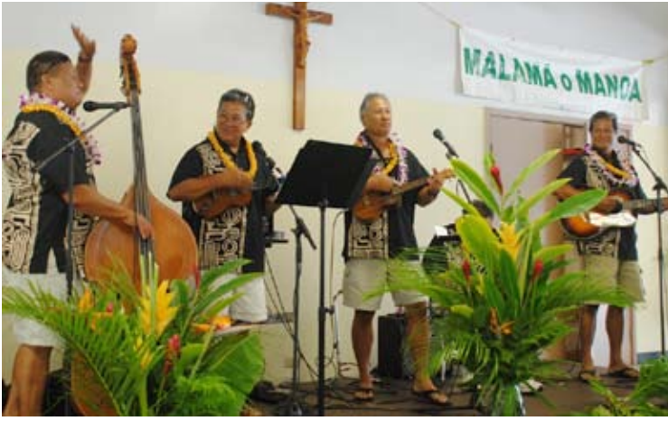
Entertainment was provided by the Waikiki Beach Band.

at one pond, watching what came down the stream after a heavy rain (trees, branches, chicken houses, dead pigs), and also a post-war flood that destroyed new housing that had just been built near Safeway. What memories!